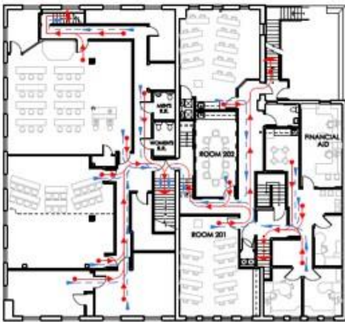
SECOND FLOOR NOT TO SCALE

Please refer to the maps for the proper path to a fire exit which are shown on the maps in red.